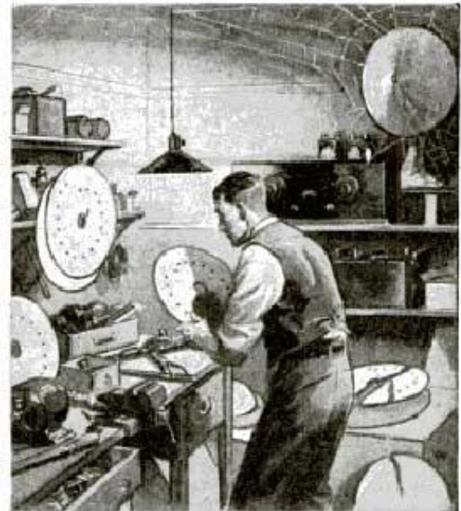
Television, newest scientific infant, offers untold possibilities to the amateur wireless experimenter in his home workshop.

maximum picture it will illuminate will be one and a half inches wide and one and a half inches high. Because the forty-eight-hole spiral necessarily must be larger than the thirty-six-hole spiral and the latter must, in turn, be larger than the twenty-four-hole spiral, it is possible to make one large disk with all three spirals in it.