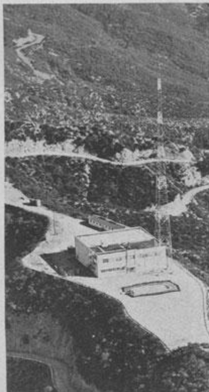
Over-all view of the Mt. Lee studio. The parabolic reflector had not been installed at the time this photograph was taken.

The building has complete sponsor viewing facilities, a special transmitter room, and a uniquely designed transcription and film projection room.