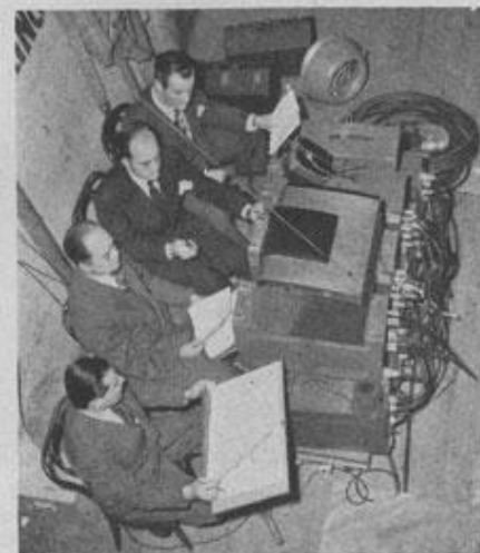
RADIO & TELEVISION NEWS