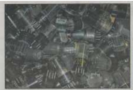
Vacuum tubes were among the thousands of parts and pieces enthusiasts could pick through during the annual convention May 5 to 7 at the Early Television Museum in Hilliard.