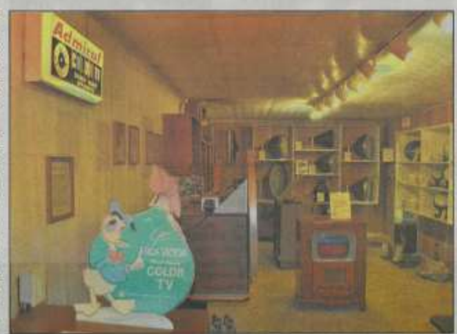
An image of Donald Duck advertises an RCA color TV inside the Early Television Museum in Hilliard where hundreds of televisions, picture tubes, advertising and other early television artifacts are displayed.