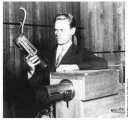
Figure 3: Philo Farnsworth holds an image dissector used in his early television camera

In the 1920s—the beginning of the modern or electronic television era there were essentially just two players: Farnsworth, with his seriously under-