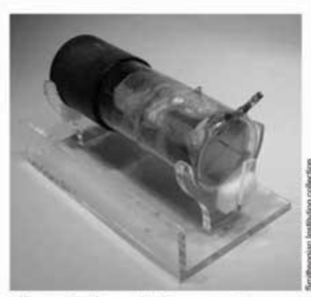
Figure 1: An early Farnsworth image dissector

To make the storyline comprehensible to a general audience, playwright Aaron Sorkin has "dumbed down" the technical elements of what both Farnsworth and RCA research camps were doing in the 1920s and 30s especially that which led to litigation over priorities and patents. Theatre