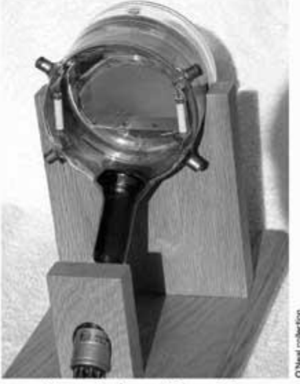
Figure 2: A small Zworykin iconoscope

In this day and age of inexpensive and readily-available solid-state imaging devices, conversion of a light pat-