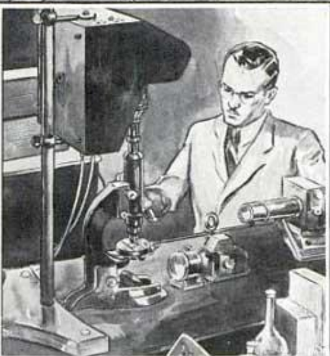
Top, How "Mosaic" Television Can Be Used in War: Center, Booster Station Plan; Below, Using with Microscope to See Tiny Objects in Motion

ness. The portable television camera makes it possible for an aviator to fly over enemy lines at night and visualize the secret maneuvers for his superior officers stationed behind the lines. Television camera lenses secreted at strategic points would give commanding officers a constant graphic description of operations in no man's land at night.