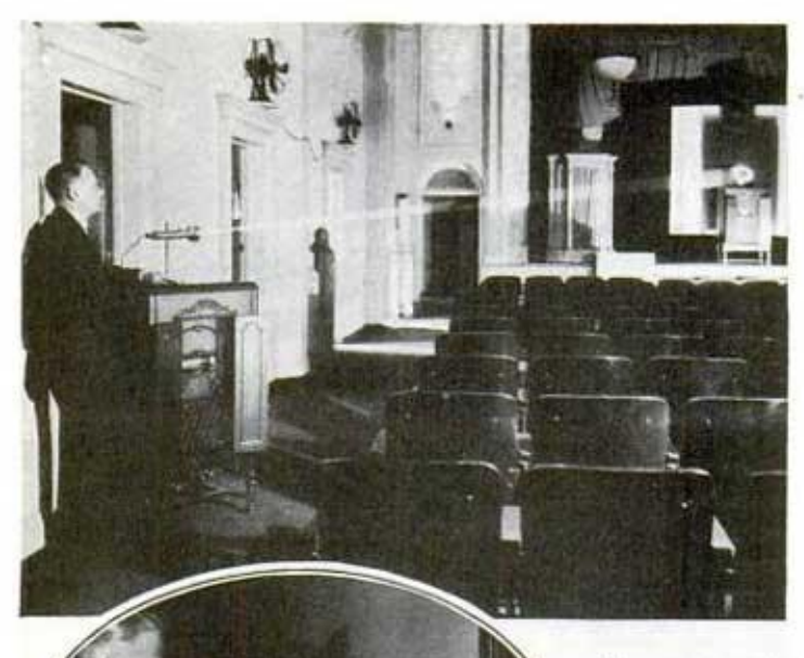
Above, Showing How Speech May Be Transformed into Beam of Light, Transmitted to Photo-Electric Cell and Converted Back to Original Form; Below, Demonstrating Cathode-Ray Television Set

scheme of transmission; the chief part of the receiving end is the kinescope. The iconoscope corresponds to the human eye; the kinescope is the brain. Both these devices have cathode-ray tubes which fire powerful beams of electrons. In the transmitting end the cathode rays are fired against 3,000,000 photo-cells which convert this energy into short radio waves which are broadcast; in the receiving end the cathode rays are fired against a fluorescent screen which shows us the moving image. Simply the system does this-it converts a moving picture at the transmitting end into radio waves which are turned back into a moving picture at the receiving end.