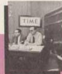
Exclusive TV Broadcasts of Kefauver Hearings