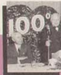
Heart Fund Marathon Telecast