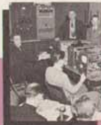
Mobile TV Control from St. Joseph's