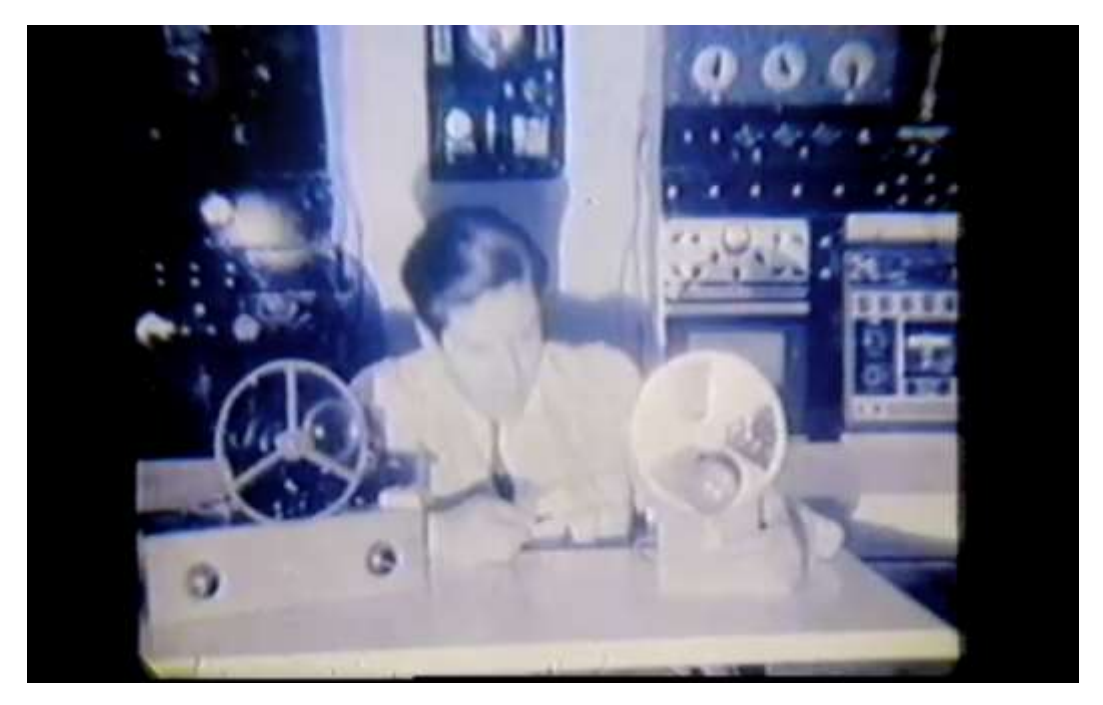
Two color wheels. The one on the left is placed in front of the camera, the one on the right is in a receiver