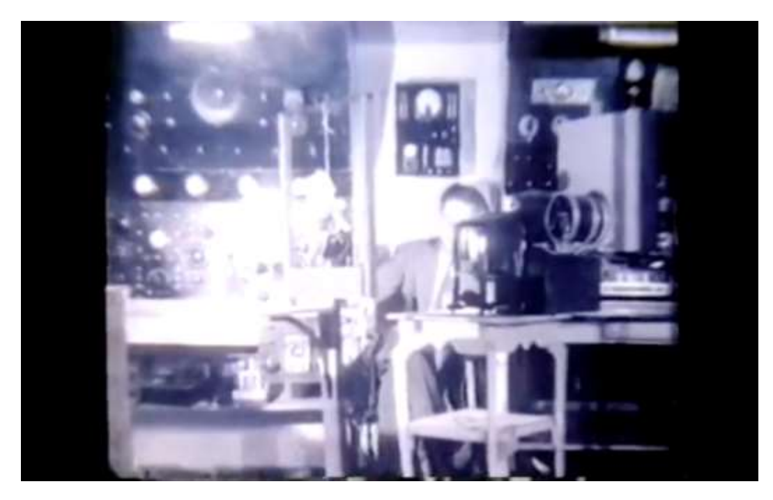
Camera and lens can be seen to the right