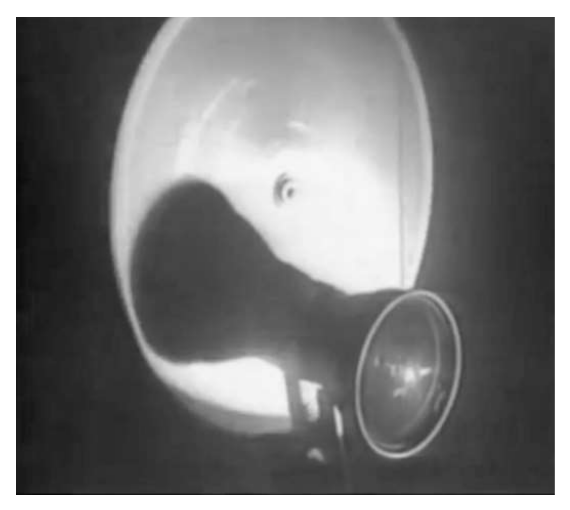
An external color wheel that might have been used with the camera