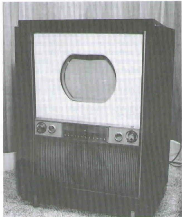
This 15-inch color television, model H840CK15, was made by Westinghouse in 1954. At a cost of $1,295, no wonder only 500 were made.

Early television collectors are planning their first annual convention and swap meet, to be held April 12 and 13, in Hilliard, Ohio. The event will include demonstrations of early television equipment, panel discussions, and presentations. Anyone having early TV equipment they would like to display or demonstrate will also be welcome. For more information, call 614-771-0510 or email etf@columbus.rr.com .