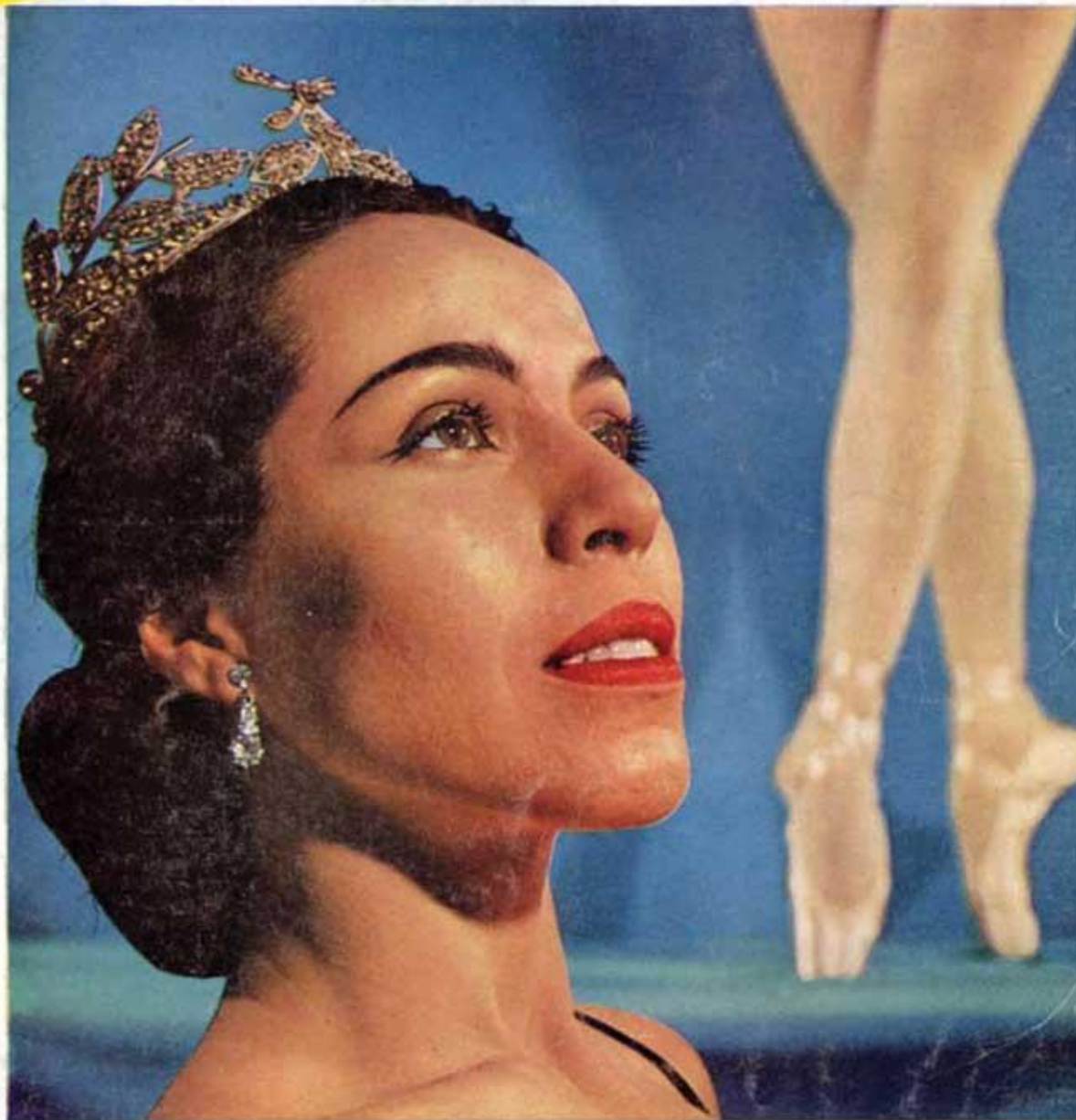
The Ballet's Tallchief: Native Dancer (See The Dance)