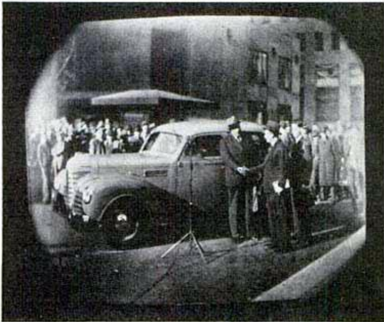
Iconoscope camera (top) being trained on automobile (center). Bottom, same scene on receiving set. Comparison with regular photo at center shows how far television has advanced in this country