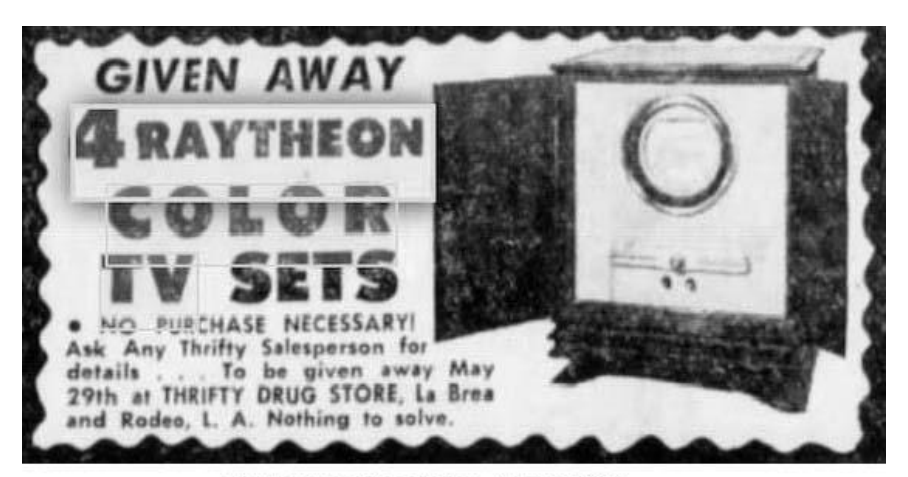
Palm Springs Desert Sun, April 26 1954

A "give away" of 4 Raytheon color sets at a Thrifty Drug store in Los Angeles, CA. on May 29, 1954. Ad published April 26, 1954.