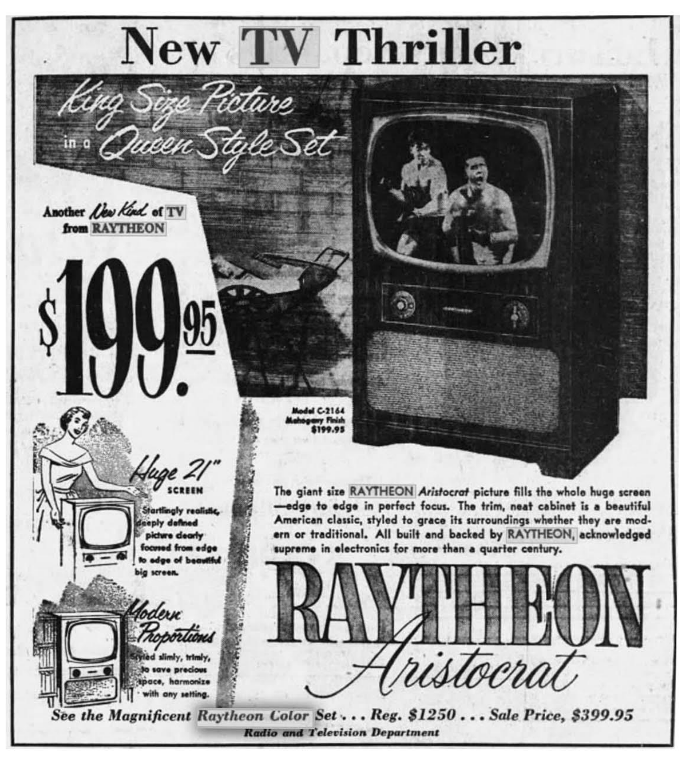
Chicago Tribune, September 30, 1954

A Raytheon color set reduced to $399.95 and offered for sale at a Chicago department store on September 20, 1954.