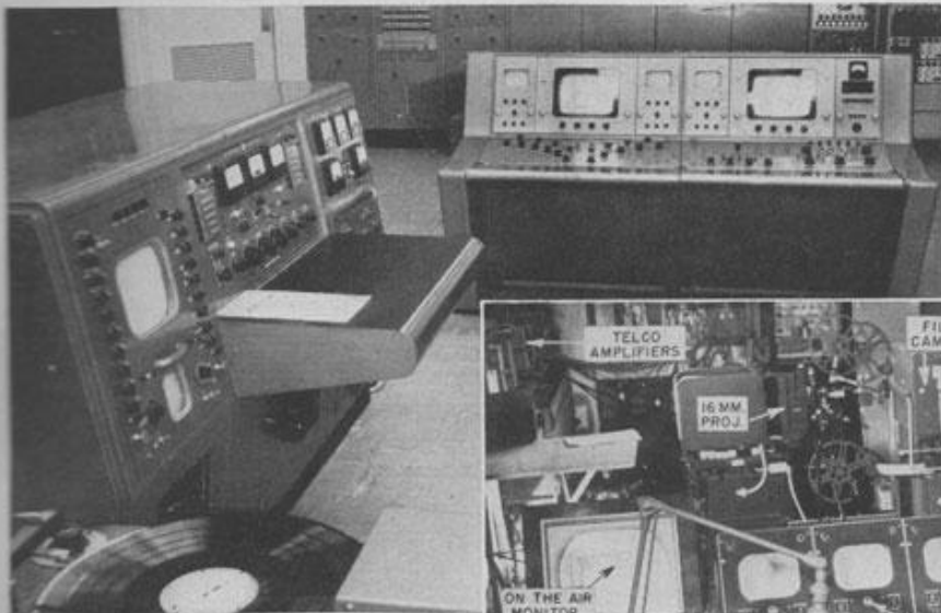
← Close-up of transmitter control console (left) and video console (right, center). The turntable in foreground belongs to sound desk. The video mixing desk operator faces the TV and audio racks which line wall behind the console in right center. Instruments enable operators to set and maintain proper audio and video levels of the signals feeding into the transmitter unit.