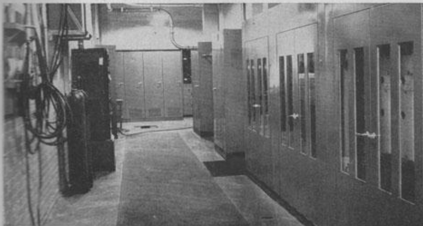
Passageway behind the FM and TV transmitter racks. Nearest racks house the television transmitter with diplexer mounted above. The other racks contain the FM transmitter. In the left foreground is the dummy antenna while above it are the dehydrators for automatically pressurizing the transmission lines. Racks in background contain telephone terminal equipment (audio and video) and test and measuring equipment.

At this writing WOR-TV is originating its television programs from two studios and two associated control booths in the New Amsterdam Roof (Continued on page 148)