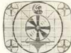
Figure 10. Ignition interference from automobiles, etc.