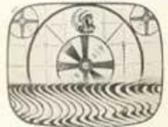
Figure 12. Diathermy interference from hospitals, etc.

Your Admiral Television set uses the most improved methods to eliminate the effects of interference on television reception. Interference caused by the operation of certain types of electrical equipment can usually, though not always, be eliminated or minimized. To avoid interference, an outdoor antenna should be used and located