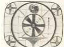
Figure 11. "Ghost" because of reflected signals.