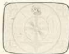
Figure 6. Too little contrast; turn CONTRAST to right.