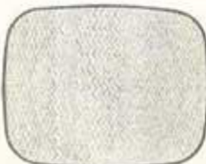
Figure 3. Gauze like pattern; adjust FINE TUNING.