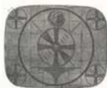
Figure 2. Too little brightness; turn BRIGHTNESS to the right.