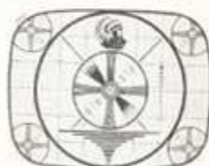
Figure 1. Ideal Picture.

IMPORTANT: Figures 2 and 3 show the result of incorrect adjustment of the Brightness and Fine Tuning controls. Correction in each case is obtained by following instructions given with each figure. If you cannot tune in a satisfactory picture, see "Operating Hints" above and "Auxiliary Controls" on page 6.