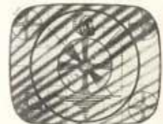
Figure 9. RF interference from nearby radio transmitters.