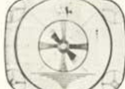
Figure 7. Improper focus; adjust FOCUS.