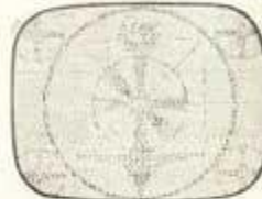
Figure 8. "Snow" because of weak signals.