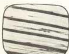
Figure 5. Picture "dips sideways" or "tears"; adjust HORIZONTAL.