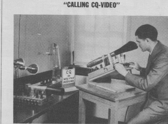
This is a complete Ham Television station. It was constructed to illustrate the practicability of radio amateur Television transmission and reception on 2½ meters. Demonstrated in actual operation, this equipment was hit of the Chicago Radio Parts Show. Most amateurs already have many of the required components. But even though you start from "scratch," it is possible to duplicate this system for no more than the cost of an ordinary medium-power transmitter.

The lighting equipment required for operation of the 1847 can be simple. Inside-silvered lamps are a convenient form of light source. When an f2.3 lens is used, adequate lighting of photographs, drawings and other still subjects can be provided by a single 200-watt, inside-silvered, spot-