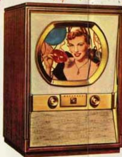
MODEL 19CK1—Luxurious 19-inch (205 sq. in.) screen console in lovely mahogany solids and veneers. Contemporary styling accented by Motorola Glare Down/Sound Up Styling.

Now, you can take your choice of three beautiful Motorola color TV sets. Their superb craftsmanship, outstanding design and lovely woods will earn them a place among the finest furnishings. Without a doubt, they are worthy cabinets for Motorola color TV—the finest in color television.