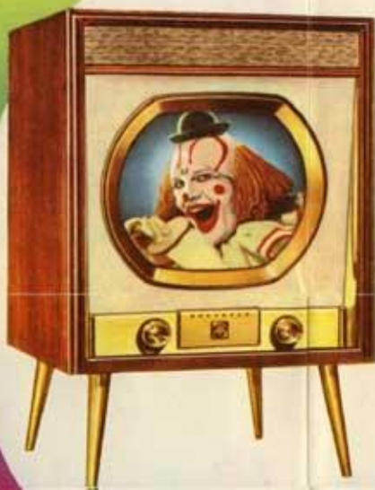
MODEL 19CK2—Here's modern design just as you like it in magnificent mahogany solids and veneers. Detachable spun brass legs. Big 19-inch (205 sq. in.) screen.

THE GREATEST DEVELOPMENT OF THE ELECTRONIC AGE