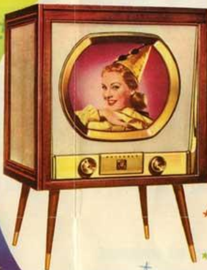
MODEL 19CT1—Exciting modern design in solid hardwoods and mahogany veneers. Dual speakers pour sound out both sides of cabinet—through Hi-Fi grille cloth. 19-in. (205 sq. in.) screen.