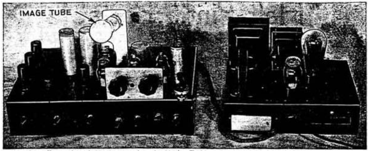
Above—The complete television image receiver using 14 tubes. The image appears on a 2-inch standard cathode-ray tube.