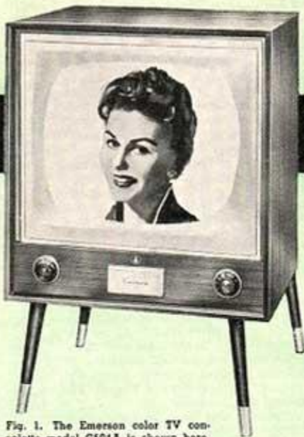
Fig. 1. The Emerson color TV console model C504A is shown here.

Six models are available ranging from $678 to $914. All have the 21-inch color picture tube, new circuits.