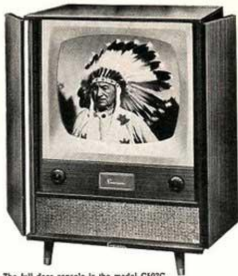
Fig. 3. The full door console is the model C502C. The nameplate covers the necessary color controls.