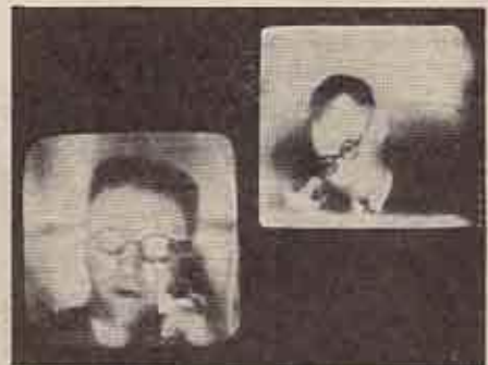
Above—Actual reproductions of the television images of two persons telephoning to each other, as observed on the monitor in the telephone exchange.

This new voice-image phone service has been extended to Munich and auxiliary lines to Hamburg and Cologne are under construction. Thanks to the newly designed scanning drums, which are fitted with a new type of lenses instead of ordinary holes, the amount of light required to scan the subject has been markedly reduced. The scanning drums are, of course, driven at synchronized speed at all television-telephone station booths and are checked at regular intervals. One of the photos shows an (Continued on page 636)