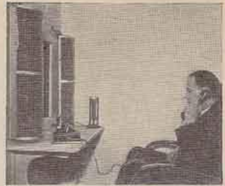
Above—The sound-vision booth at Berlin. As you talk to the person at the other end of the line you see his image as well as hear his voice.

connecting the Bell Telephone Labs. with a building approximately four miles distant in downtown New York. With improved transmission efficiency and new scanning apparatus, German telephone subscribers by paying a special fee, are now able to talk with and actually see the person at the other end of the telephone line, between cities like Berlin and Leipzig. A special booth is used wherever this service has been made available to the public and new infra-red lamps illuminate the person's face; this light although invisible to the human eye, when reflected from the face will cause the sensitive photo-electric cells to register the varying degrees of light and shadow. These cells convert the different degrees of light into electrical impulses, which are carried over the television circuits; the television image signals are transmitted over co-axial cables.